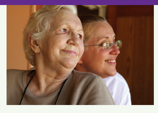
Certified. Experienced. Secure.